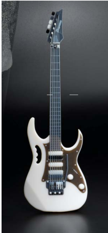
Image 6: Guitar made from black and white rigid model materials and Digital Materials with different gray scales.

Greyscales and Tones – One of the advantages of using more than one model material is the ability to create greyscales and tones. For example, using VeroBlack and VeroWhite as basic materials and combining them in various ratios creates different greyscales. Creating greyscales and tones makes it possible to print marks and signs on a model, mark desired areas of interest and even add captions (Image 6).