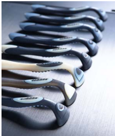
Image 2: All the razors in the image were printed simultaneously in a single run, within 12 hours. Every razor is composed of different materials (including Digital Materials) with different mechanical properties (rigid and flexible). These prototypes undergo feasibility tests and assist in defining the end-product's final materials

Connex enables parts to be printed simultaneously from multiple materials in a single run (Image 2).