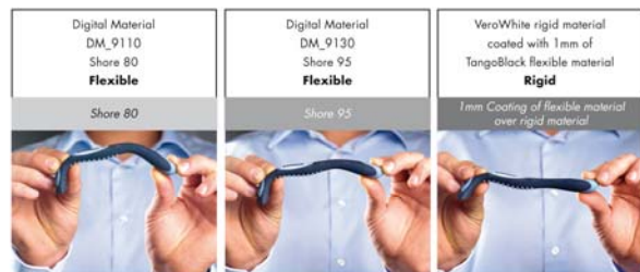
Image 3: All three razors in the image were printed simultaneously in a single run, within 2 hours. Every razor is composed of different materials including Digital Materials

Connex simultaneously prints parts with different mechanical properties. This capability enables the user to test printed prototypes that are very close to the production part in terms of mechanical properties and material combinations, e.g. over-moulding and double injection. Thus it aids in selection of the production materials that will be used in the final product (Image 3). This process saves days of simulating and preparing complex and expensive moulds for double injection. It also eliminates the need for silicon moulds and preparation of different end-product materials for testing by enabling most of the testing to be done on early stage prototypes printed overnight on Connex. This capability improves communication between different groups and decision makers in the company, such as R&D, internal/external customers, engineering, marketing, sales and management