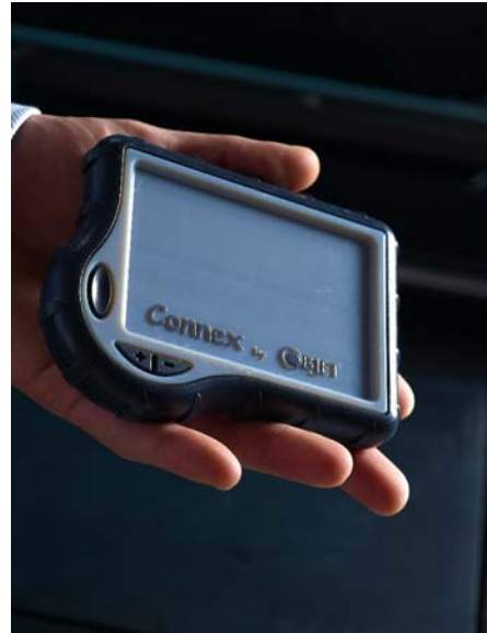
Image 4: A GPS device printed in a single run emphasizes an over-molded part. In this case, the rubber-like and rigid materials printed on Connex 3D printer at the same time eliminate the need for providing separate silicon molds of different materials and gluing them together, a process that normally takes several days to perform

The ability to combine rigid materials and flexible rubber-like materials is a real necessity for applications that have a rigid body with areas of flexible material for grips and protection of the mechanism, and thus require a double injection production process. Examples of this pressing need exist in most of the current products in consumer goods and electronics, automotive, shoes and medical industries. Connex parts are the first tangible tool for simulating double injection moulds (image 4).