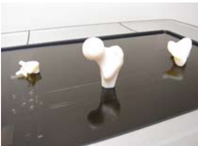
Orchid's device and implant prototypes 3D printer: Alaris30