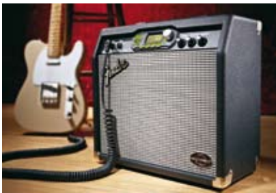
Fender's Guitar amplifier prototype