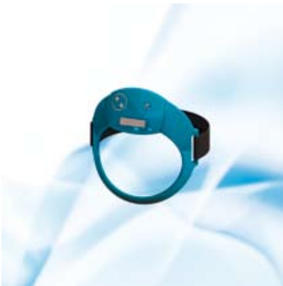
Ivivi's medical device prototypes 3D printer: Eden350

Rapid prototyping was a game-changing innovation for industrial designers when it was introduced two decades ago. Previously, prototypes would be constructed from wood or metal in woodwork or machine shops. The process took weeks or months and the cost was often so prohibitive that designers skipped prototypes entirely and went directly from CAD to tooling. Often this meant that design flaws were not identified until manufacturing began, leading to expensive re-work and lost time.