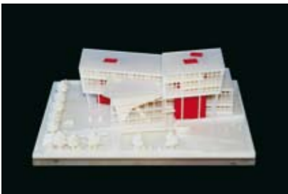
Rietveld's building prototype